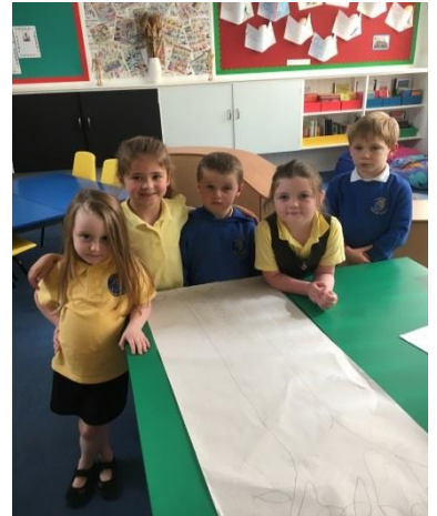
Learning to work as a team and using information from a story