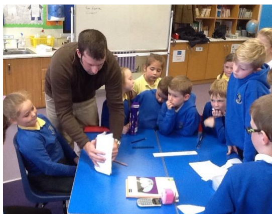
Learning to create strong structures to solve an engineering challenge!